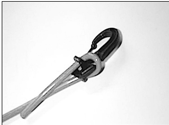
Photo 2. Hook and Cord Assembly