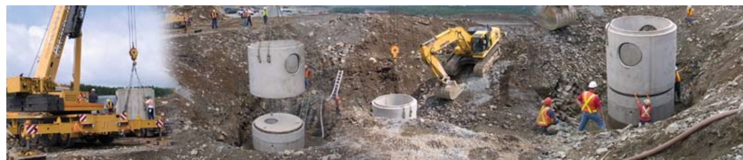
Dartmouth Crossing Installation

efficiency as sediment accumulates. CDS units can be custom tailored to meet a wide variety of physical and hydraulic site specific conditions including: multiple pipe configurations and submerged applications. Systems can be provided in offline or inline configurations. Offline units can treat flows from 30 to 8500 L/s. Inline units can treat up to 255 L/s and internally bypass larger flows up to 1420 L/s (50 cfs). The pollutant removal capability of the CDS system has been proven both in the lab and in the field.